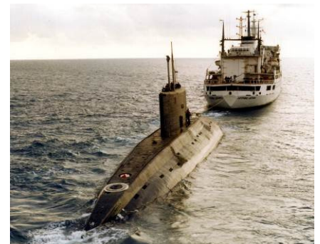
State-of-the-art Iranian Submarine