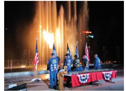
Representatives of the Topeka-Jefferson City U.S. Submarine Veterans Base salute the American flag during a rendition of the national anthem

Members of the Topeka-Jefferson City U.S. Submarine Veterans Base held a candlelight ceremony at Branson Landing Saturday night to remember the 65 American submarines that have been sunk during wartime.