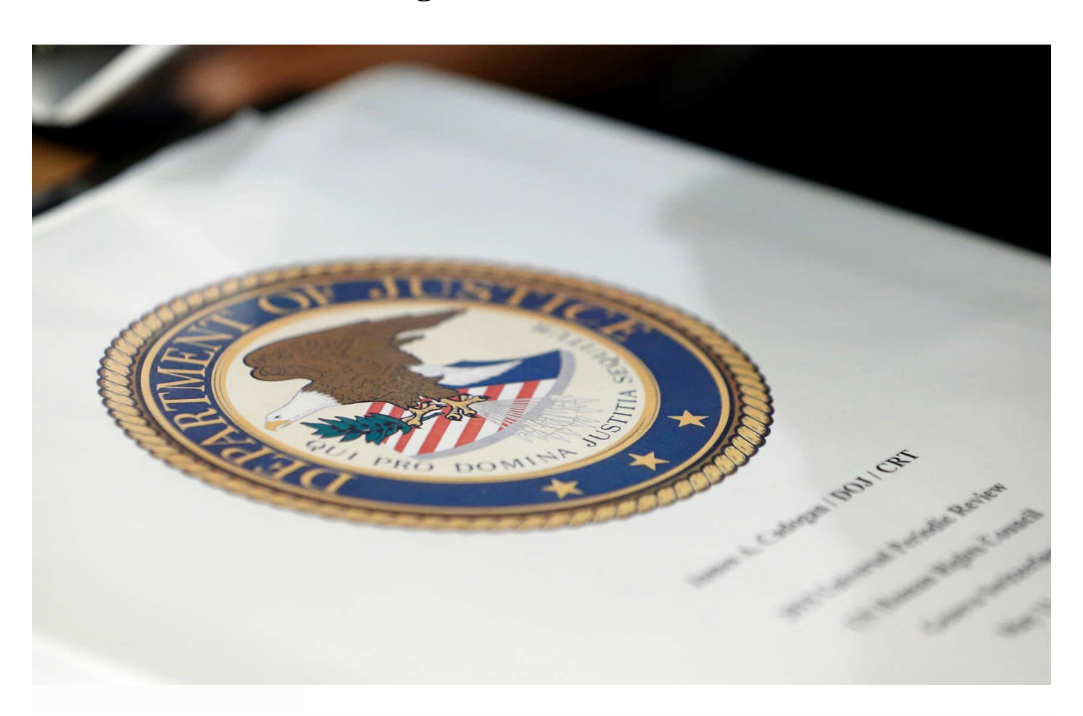
Reuters/Denis Balibouse FILE PHOTO: Folder with the seal of the U.S. Department of Justice sits on a table at the U.N. in Geneva